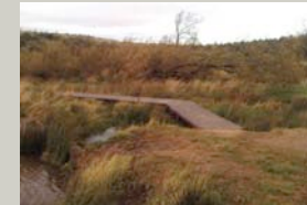
View from the Dipping Platform